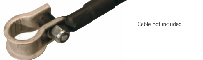
Cable not included