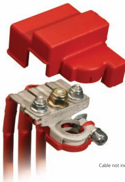
Cable not included